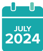
Exhibit Signup Deadline